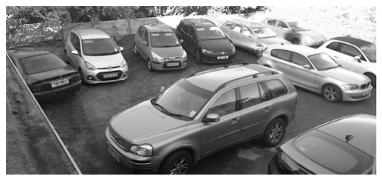
(The Rectory 'car park' on a Monday morning during lifegroup)

In September we launched our first ladies' daytime lifegroup which meets on Monday mornings in the Rectory. Two members of St James in Gerrards Cross and Fulmer are helping us to establish this new group, which has grown very quickly and helped members to grow in faith and friendship. New members and guests are always welcome. A session consists of a catch-up over a cup of coffee, a time of sung worship, a Bible study with discussion and prayer. In the autumn the group used the course "What's so amazing about grace?"