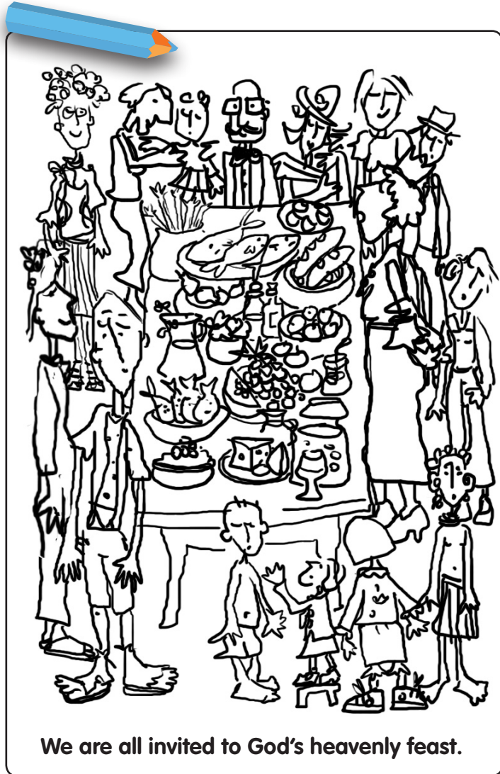
We are all invited to God's heavenly feast.