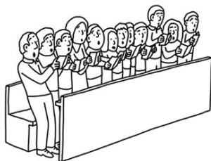
UNLIMITED CONGREGATIONAL SINGING