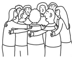
UNRESTRICTED SHARING OF THE PEACE