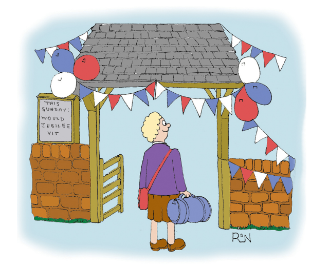
The visiting preacher was delighted with her welcome.